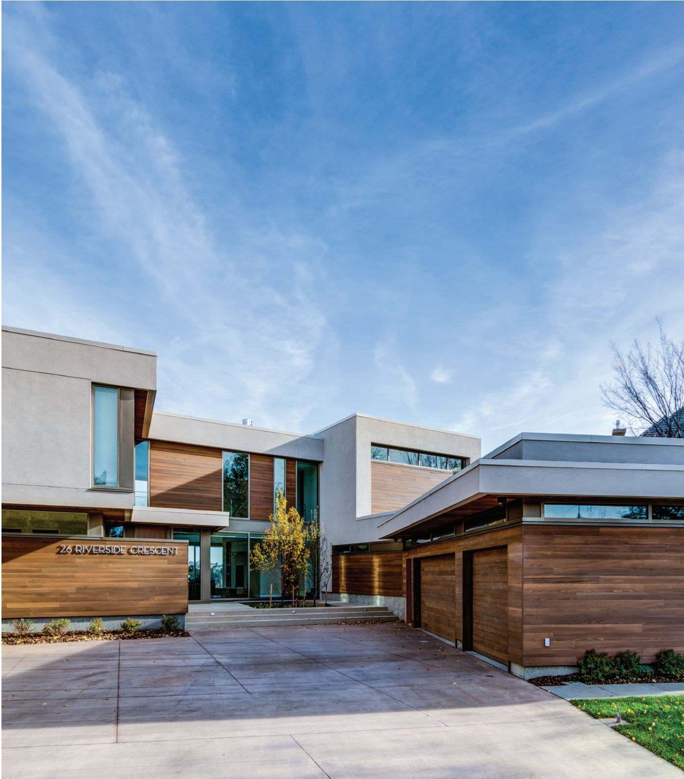
ABOVE, RIGHT High-end residential and commercial architecture are the heart the firm's design visions.